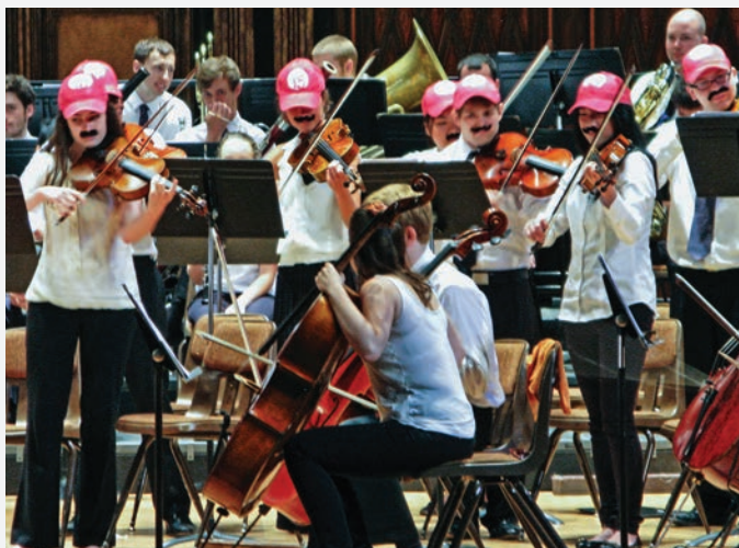
The Young Persons' Concert is a playful way to learn about the instruments and sections of a symphony orchestra

The Young Persons' Concert represents one of the twenty-five concerts presented during the Round Top Music Festival. Free to the public, this performance introduces children to music. It will be at eleven o'clock on June 10. An orchestra