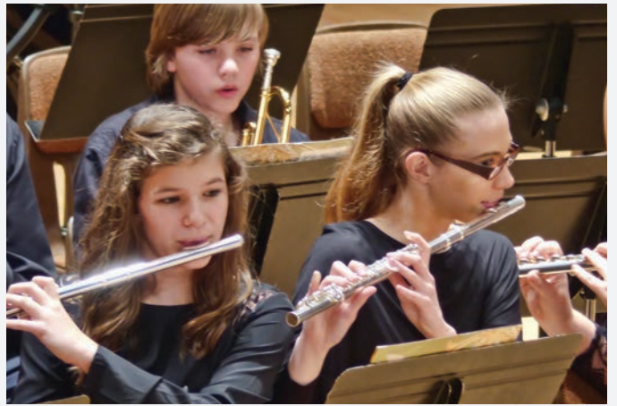
Local music students perform in the Festival Concert Hall