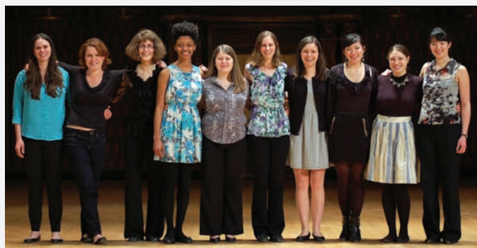
Semi-finalists from the recent bassoon competition

Round Top Festival Institute's Festival Hill campus provided the space for this inspiring event of master classes, concerts and seminars by world class bassoonists. The January 2014 symposium was open to bassoonists of all ages and ability levels, and featured world premiere performances of the