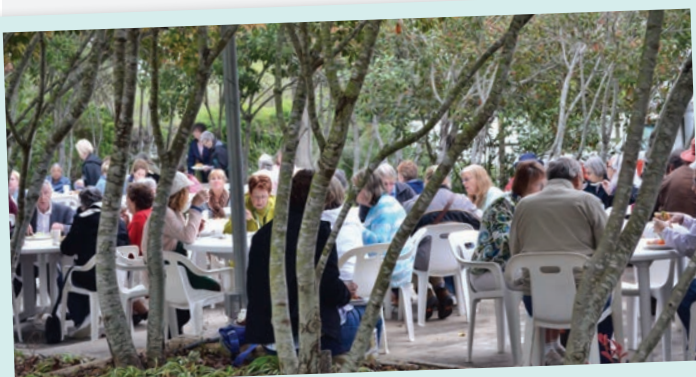
As we get ready for our next Herbal Forum, a popular sell-out occasion, we thought you might enjoy this look at the Herbal Forum luncheon gathering from last year.