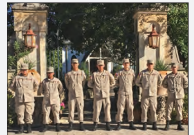
Cadets from the Texas Challenge Academy attended the UT Wind Ensemble concert.

Among the concert attendees were seven cadets from the Texas Challenge Academy near Eagle Lake, Texas. Their superior shared this positive sentiment, "I want to send my heartfelt gratitude to everyone at Festival Hill. The Cadets from Texas Challenge Academy